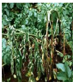
Bacterial wilt infection