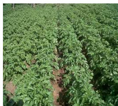
Clean certified seed potato