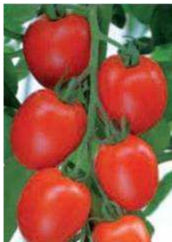
Royal Seed Tomato 'Monalisa FI'

'Tomatoes are an essential vegetable that no home should be without'