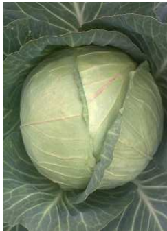
PRETORIA FI Cabbage ~ Royal Seed fresh market variety.