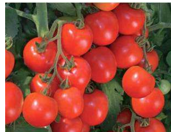
Royal Seed Tomato 'Samantha FI'

indeterminate tomatoes outdoors start with well-done transplants that are then transferred either into ground containers such as grow bags or large pots. The idea of using bags and pots can be well utilised by urban residents for whom land and space is limited. Stout support must be provided, because these varieties are truly heavy bearers, and fruit harvest starts approximately 75 days from transplanting.