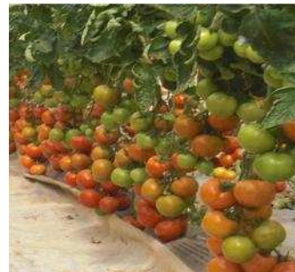
Royal Seed Tomato 'Chonto FI'

Tomatoes are an essential vegetable that no household should be without. There are two types of tomato plants, determinate (normally grown outdoors in this region) and indeterminate that are grown in protected structures such as polytunnels or greenhouses. However, if you do not have a tunnel or greenhouse, it might be worth growing them outdoors- though yields will be lower. Fewer tomatoes are better than no tomatoes at all. Tomatoes love warmth, therefore growing indeterminate varieties like Chonto FI, Bravo FI, Samantha FI, and Monalisa FI from Royalseed, outdoors will have to be done in warm regions or during warm seasons for best chance of success. Techniques used to grow