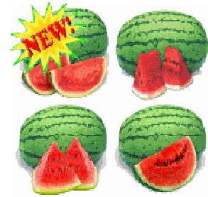
Watermelon 'Asali F1' from Royal Seed.

The enzymes involved in forming collagen (the main component of wound healing) cannot function without vitamin C. If you are suffering from any slow-healing wounds, eat more melons to speed up the healing process.